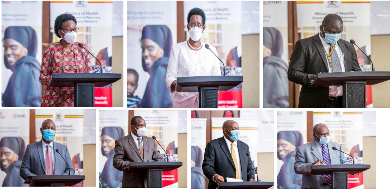
Representatives from MoH, MoFPED, MoLG, MoICT&NG, MoPS, Office of the Prime Minister at the official launch of the 10-Year Roadmap for Government of Uganda's Health Supply Chain Self-Reliance

Below are notable statements of roadmap implementation commitments from GoU ministries.