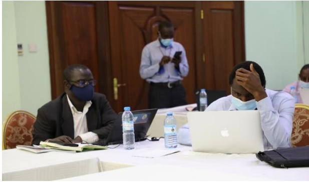
SSCS Activity team engaging with National Drug Authority team