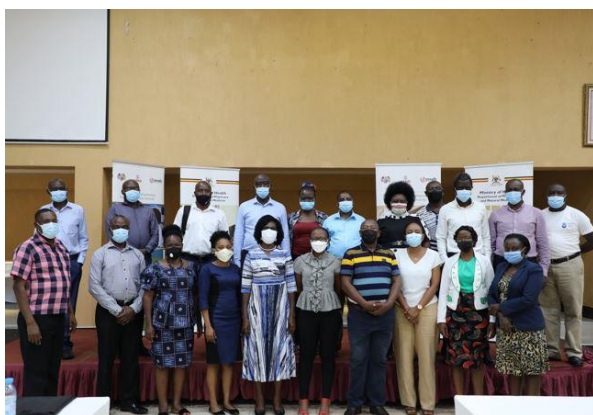
Group photo: Participants of the second Inter-ministerial Task Force sub-committee retreat

MDAs and other stakeholders were represented at two Inter-Ministerial Task Force sub-committee writing retreats held in June 2021 and September 2021 to draft content with the assistance of subject matter experts. The one government approach took shape in these meetings with government-led deliberations. Ownership and stewardship of the process through joint brainstorming; common understanding; consensus building; and commitments on the content, structure, and modalities of developing and implementing the roadmap were quite evident. MDAs chaired relevant thematic / chapter sessions, for example, health supply chain resource mobilization and financing by MoFPED; human resources chaired by MoPS; health commodities management, infrastructure, warehousing, and distribution co-chaired by MoH and NMS; and health information systems chaired by Ministry of Information and Communications Technology and National Guidance (MoICT&NG/National Information Technology Authority of Uganda (NITA-U).