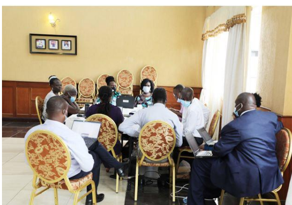
Working session: Participants of the second Inter-ministerial Task Force sub-committee retreat

At a high-level multisectoral meeting on December 3, 2021, the one government approach was further illustrated when top MDA leadership came together to enhance inter-sectoral collaboration in the roadmap's development and implementation. They discussed sectoral roles in harmonizing the roadmap's planning and budgeting frameworks, and most MDAs committed to successful implementation, which was reiterated at the official roadmap launch.