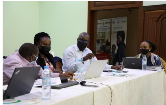
SSCS Activity team engaging with MoLG team